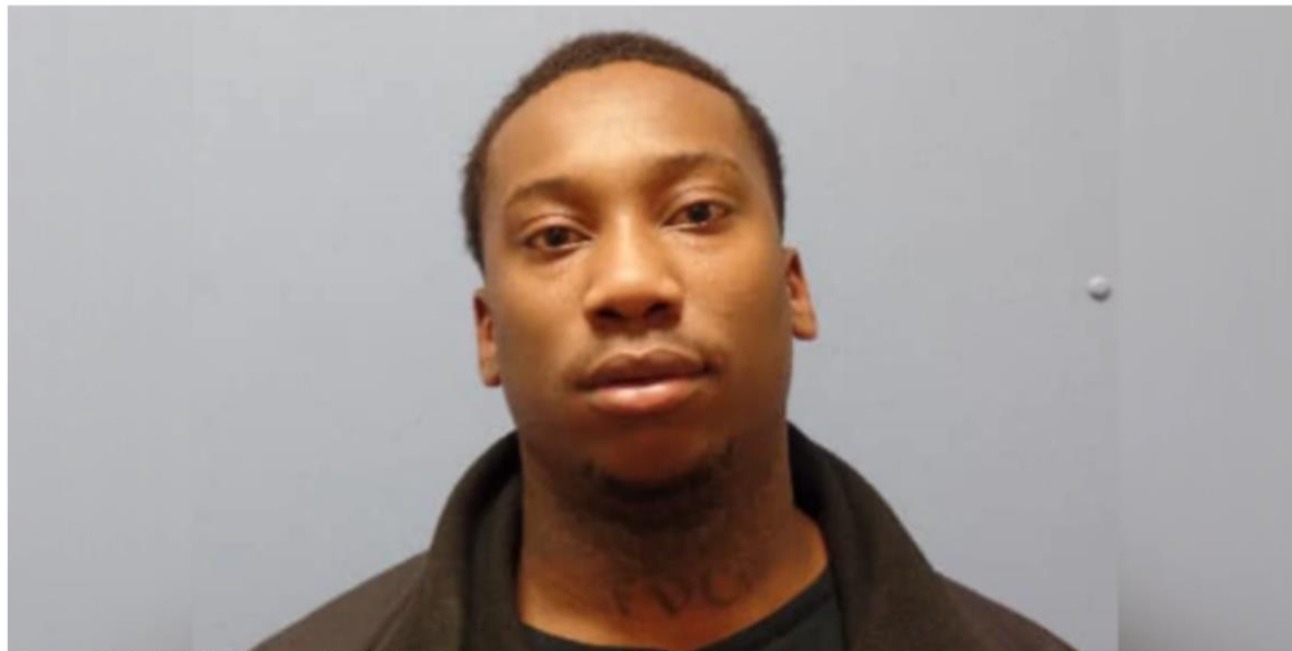
Man wanted by Sandusky Police in connection of 4 victims being shot

By Rachel Vadaj | September 28, 2020 at 12:33 PM EDT - Updated September 28 at 12:33 PM